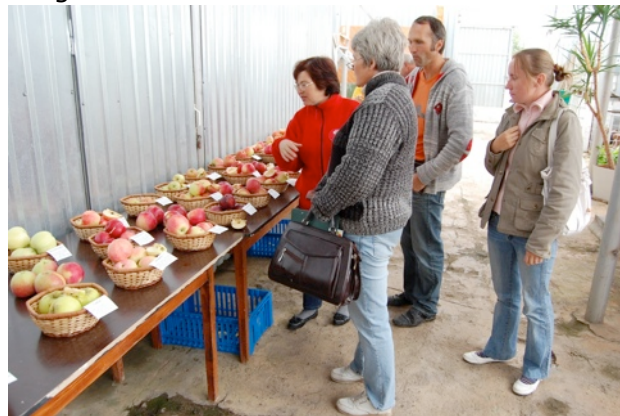
Fruit exhibition - training in the State Institute of Fruit growing of Latvia

At the same time we were organized trainings on summer pruning of fruit trees (cherries, apples) and such an important topic as yield quality management.