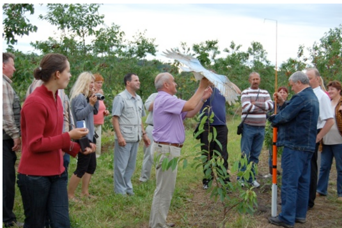
Experience exchange visit in orchards in Latvia

We have created video, photo, informative and press materials for farmers, producers and consumers of fruit and berries, which we distributed during different events. We have created our own interactive website of the project www.fruittechcentre.eu , where we inform not only about the project activities, but also give useful information to all target groups about fruits, technologies, solutions of different problems. We inform about our project and consultations we provide during the exhibitions, trainings, experience exchange visits and seminars for farmers in Lithuania and Latvia.