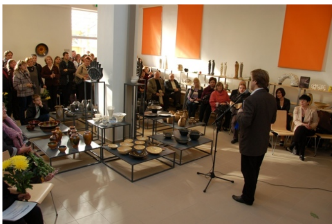
Opening of the Clay Art Centre

A wide range of renovation and cultural activities have also been implemented by the Lithuanian colleagues.