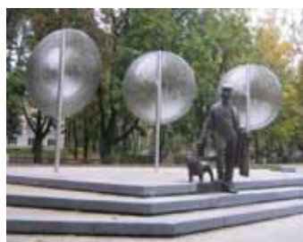
Dubrovins Park in Daugavpils