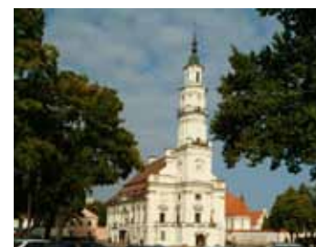
City Hall (Rotušė) in Kaunas

The city of Daugavpils is situated in South-eastern Latvia and lies on the banks of the River Daugava which is the largest and the most magnificent river of Latvia.